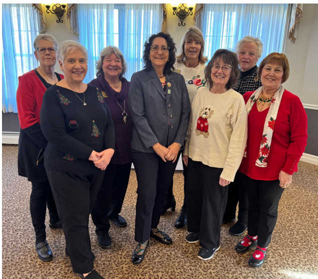
(Pictured is the NJSFWC Executive Committee )

The days just seem to fly by, and the CALL for our state convention will be out before you know it.